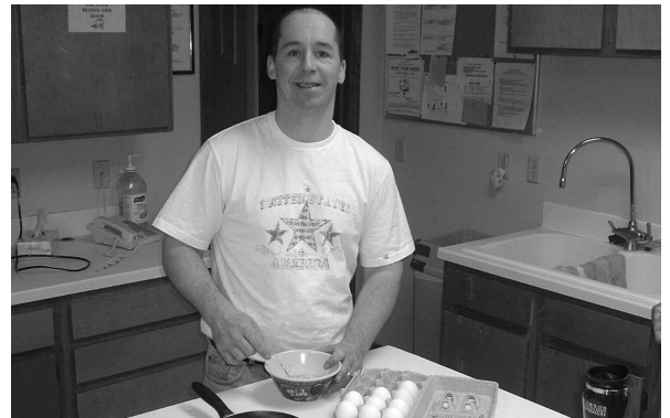
Cooking up a little something in the current student kitchen