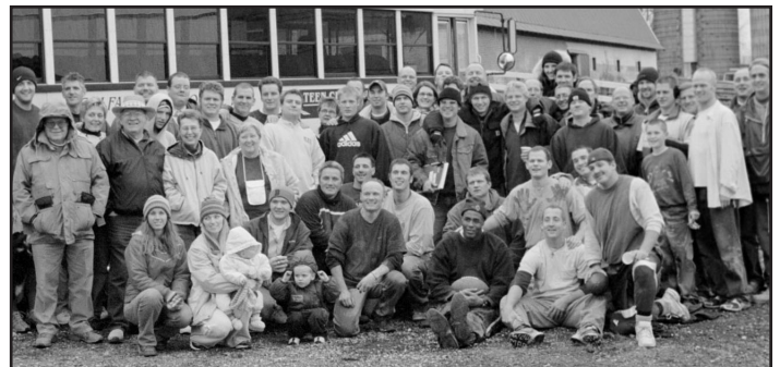
Teen Challenge at the Yoder Farm